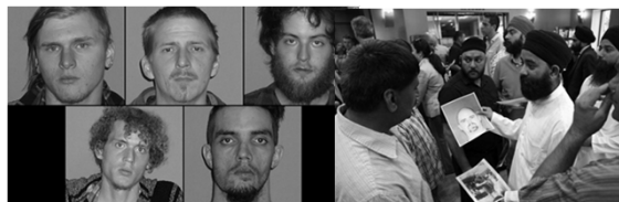
Terrorists: Suspects in Cleveland bomb plot.