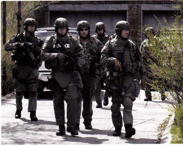
HEAVY DUTY SWAT officers from the Cape Cod Police Department patrol the streets of Watertown. Nationwide, paramilitary police units conduct more than 100 raids a day.

the Military Cooperation with Law Enforcement Agencies Act, advocated the repeal of the exclusionary rule (which keeps illegally gathered evidence out of the courtroom), and expanded civil forfeiture laws, which allow the state to confiscate money and property related to criminal activity. In addition to shifting the burden of proof to defendants, these new laws created huge incentives for police departments to establish and use SWAT teams—and, perversely, to postpone raids until after drugs had already been sold. Confiscated drugs are simply destroyed, but confiscated money and property can help replenish department coffers. SWAT became a moneymaker.